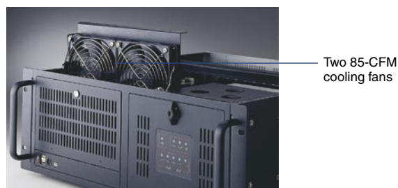
Two 85-CFM cooling fans